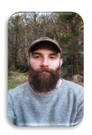
Project Assistant Norway