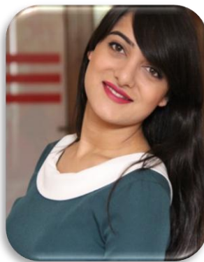
Project Assistant Armenia