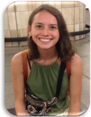
Project Coordinator Germany