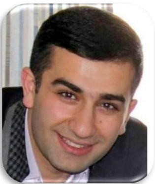
Project Manager Armenia